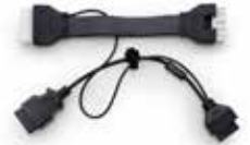
SMART Pro Bypass Cable for Renault ADC2017 SD755649AD