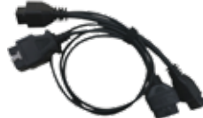
SMART Pro Chrysler Group 2018 Star Connector Cable ADC2012 SD753920AD