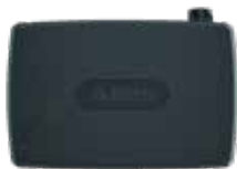
ABUS Alarmbox 2.0 Mobile Smart Alarm Battery Operated Motion Sensitive ABUSAB