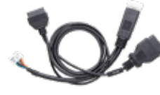
SMART Pro Bypass Cable for Toyota ADC2021 SD756924AD