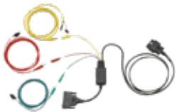
SMART Pro Toyota 'H' Bladed All Keys Lost Cable ADC2016 SD755976AD