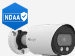
5MP AI Color+ Vandal-proof Mini Bullet NDAA Network Camera

The 2.5MP AI Color+ camera provides high-res video, H.265+ compression, 120dB WDR, built-in IR (30m), automatic illuminator, PoE, and vandal-proof design, perfect for monitoring retail, commercial entrances, and industrial sites.