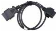
SMART Pro Chrysler Group 2018 Star Connector Cable ADC2011 SD753084AD

Advanced Diagnostics offers secure solutions for key programming when all keys are lost, with their range of cables enabling programming even when manufacturer security blocks OBD access without removing components.