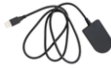
SMART Pro Emulator for Ford and Toyota When All Keys Lost ADC2020 SD756922AD