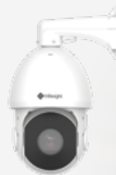
5MP 23X H.265+ Speed Dome Network Camera

This 5MP camera features a 23X optical zoom, 120dB WDR, 200m IR, PoE, IP66, and IK10 ratings, providing long-distance monitoring for large areas like parking lots, campuses, and critical infrastructure with advanced AI VCA.