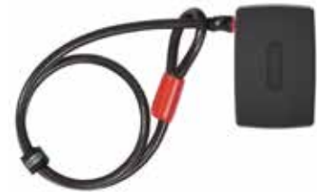
ABUS AlarmBox 2.0 with 100cm Cobra Flexible Cable 12/100 ABUSABCABLE