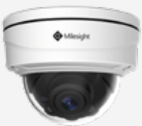
5MP H.265+ Motorised Pro Dome Network Camera

With 5MP resolution, H.265+ compression, 120dB WDR, and built-in IR (50m), this camera offers motorized zoom, PoE, IP67, IK10, and VCA analytics, making it ideal for residential security, parking lots, and retail surveillance.