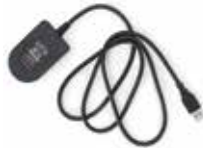
SMART Pro Emulator for Toyota (DST) When All Keys Lost ADC2015 SD755650AD