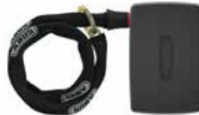
ABUS AlarmBox 2.0 with 6mm Link 100cm Long Chain 6KS/100 ABUSABCABLE