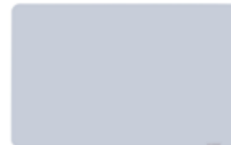
PVC with DESFire® 2K, Blank both sides and suit SPACE Platform. Pack of 50 units