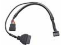
SMART Pro Bypass Cable for Toyota ADC2018 SD756295AD