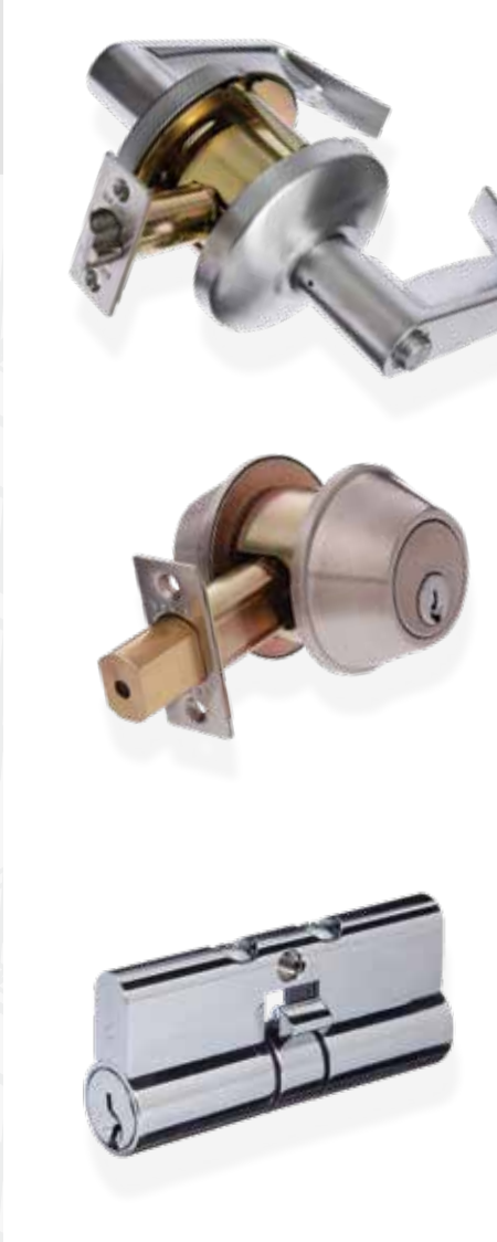
Entrance Leverset LH600B Double Cylinder Deadbolt D332B 5 Pin Euro Double Cylinder 31705PHESCKD