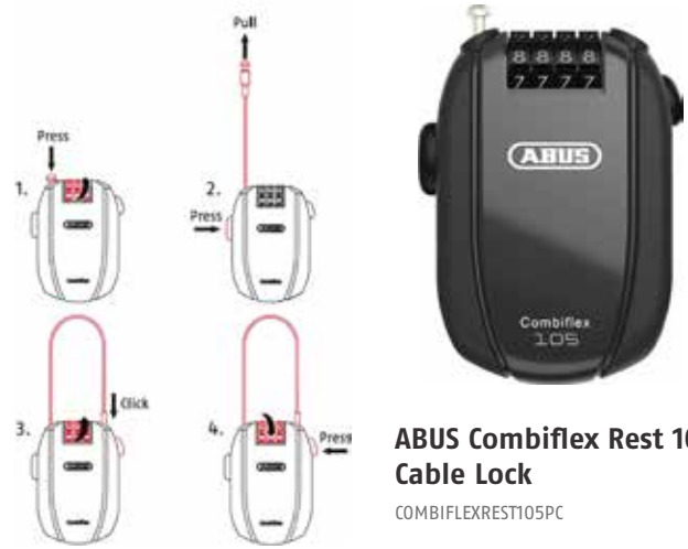
ABUS Combiflex Rest 105 Cable Lock