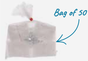
ID5 Clicktag, Printed, Assorted Colours KID5PA