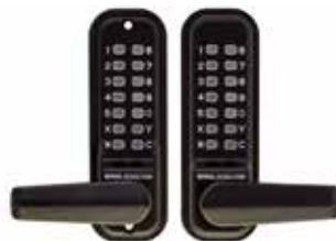
Digital Lock 4441 M/Grade Pro Lever/Lever BTB ECP BL4441MGPROECP