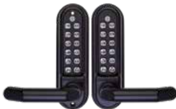
Digital Lock 5051 M/Grade Pro Black Lever/Lever BTB ECP BL5051MGPROECP