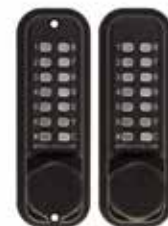
Digital Lock 2621 M/Grade Pro Lever/Lever BTB ECP BL2621MGPROECP