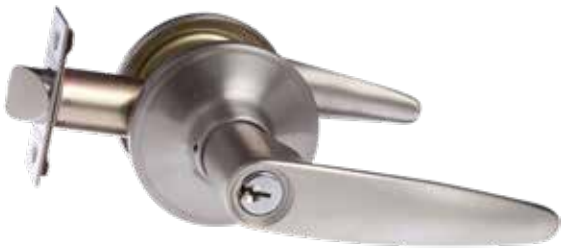
Entrance Leverset LH600B