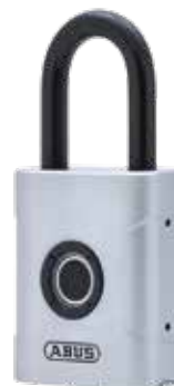
ABUS Padlock Touch™ Biometric Fingerprint Weather Resistant Silver Display Pack - 57/50