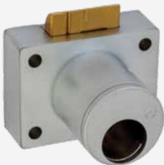
Dead-latching Cupboard Lock BR850LCASC