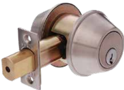
Double Cylinder Deadbolt BP210LISS