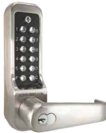
Borg Heavy-Duty Digital Lock with ECP BL7701SSECP