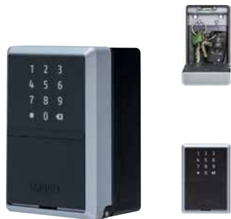
ABUS KEYGARAGE™ KG787 SMART - BLUETOOTH with mount DP (Box)

The solid metal housing and strong locking cover made from pressure-cast zinc secure against unauthorised access as required. A plastic cover also protects the number mechanism against the effects of the weather.