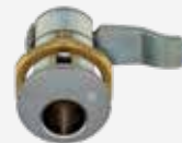
Cam Lock BR820LCSC