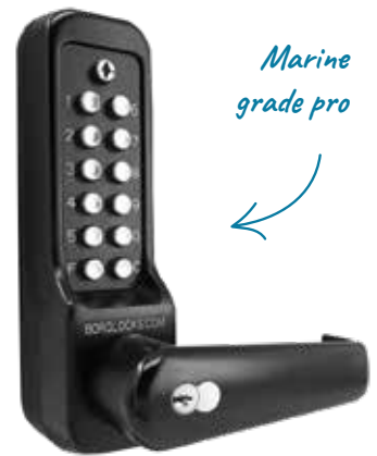
Borg Marine Grade Digital Lock with ECP BL7701MGPROECP