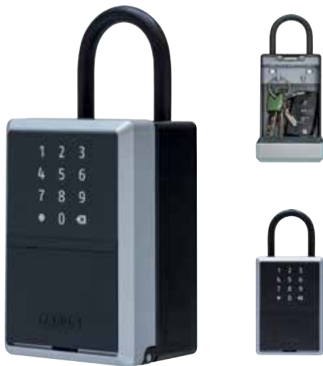
ABUS KEYGARAGE™ KG787 Shackle only suit SMART – BLUETOOTH