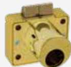
Latching Cupboard Lock (U, D, L or R) BRL78VLCAPB