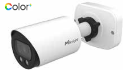
Milesight 8MP AI Color+ Bullet Camera MSC8164UPD