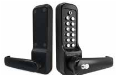
Borg Digital Lock Marine Grade with ECP Keypad Lever and SFIC Key Override Black