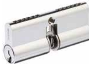
BRAVA Urban Trilock Cylinder BRUTRILOCKLW5CP