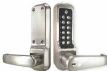
Borg Digital Lock Heavy Duty with ECP Keypad Lever and SFIC Key Override SS

Borg Locks is a trusted brand for LSC, here's to another 25 years for Borg Locks!