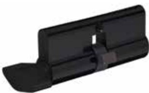
BRAVA Euro Single Cylinder with Turn 31705PHBLKCT