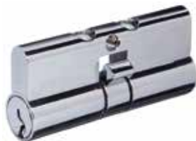
BRAVA Metro Euro Double Cylinder BRM905551CP