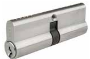
BRAVA 90mm Emergency Euro Double Cylinder 31905PHESCKD