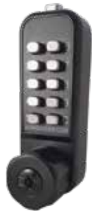
Borg MGPRO Cam Lock ECP KD BL1706MGPROECPKD KA BL1706MGPROECPKA