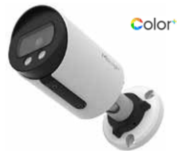
Milesight 5MP AI Color+ Bullet Camera MSC5364UPD