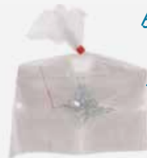
ID18 Polypropylene Access Card Holders KID18BULK