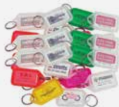
ID5 Clicktag, Printed, Assorted Colours KID5PA