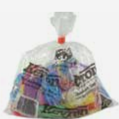
ID5 Clicktag, Assorted Colours KID5