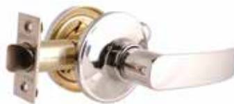
LYR PASSAGE SETS