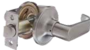
LN PASSAGE SETS