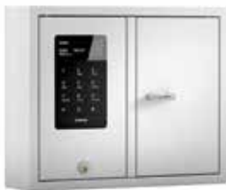
Creone KeyBox System 9001S B/Backup Audit Trail CR1413011

Total peace of mind at all times when you store your belongings or valuable equipment when connected to Creone's KeyWin6 web-based administration system; gives the right person secure storage of their belongings at all times, with the help of a laptop or tablet.