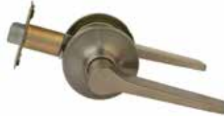
LE PASSAGE SETS