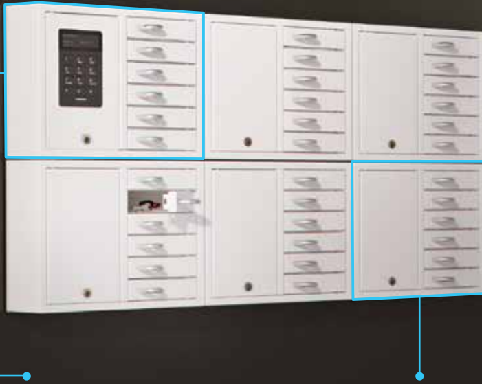
Creone KeyBox System 9006S B/Backup Audit Trail CR1413211