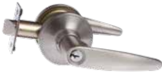
LH ENTRANCE SET