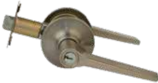
LE ENTRANCE SET