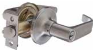
LN ENTRANCE SET