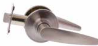
LH PASSAGE SETS