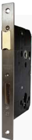
PROTECTOR Heavy Duty Euro Style Sash Lock with 60mm Backset SS PR78560SS