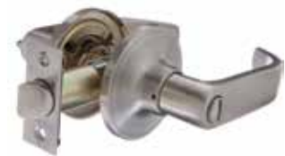
LN PRIVACY SETS