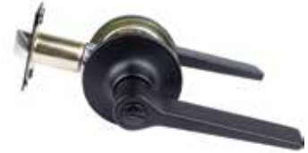
LE PRIVACY SETS