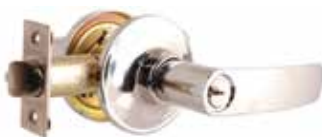
LYR ENTRANCE SET