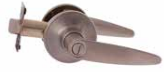
LH PRIVACY SETS