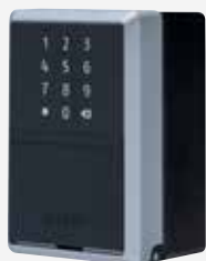
KEYGARAGE™ ABUS KEYGARAGE™ KG787 SMART - BLUETOOTH WITH MOUNT DP (B0x) KG787BTC