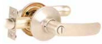
LYR PRIVACY SETS

visit lsc.co.nz to see full range of functions and spare parts available