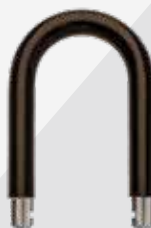
OPTIONAL EXTRA ABUS KEYGARAGE™ SHACKLE ONLY SUIT SMART - BLUETOOTH KG787BTSHKL