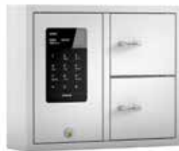
Creone KeyBox System 9002S B/Backup Audit Trail CR1413111